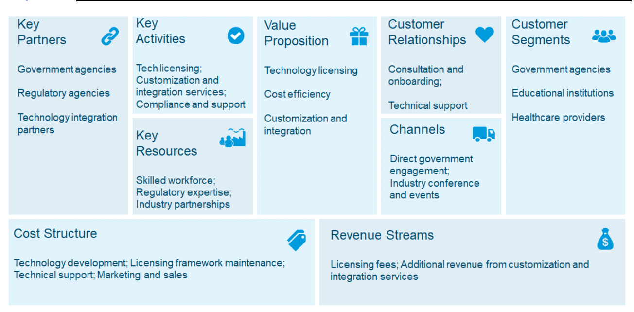
Figure 7 Model 1 (short-term): Licensing business model