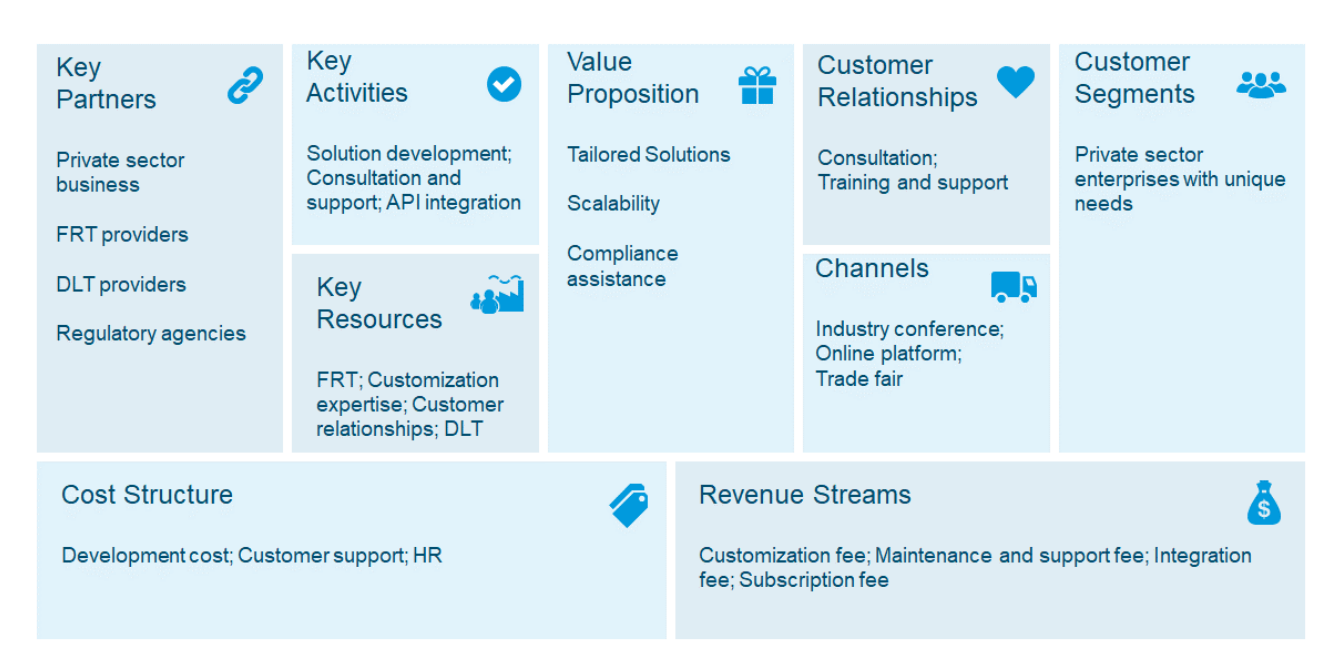
Figure 9 Model 3 (short-term): Identification-as-a-Service (IDaaS) business model

Model 3, Identification-as-a-Service (IDaaS) business model , is the short-term business model targeted to the private sector, as shown in Figure 9. This model focuses on the existing functionalities of IMPULSE, similar to the justification for the short-term model in the public sector. This model provides private sector clients with customized FRT-enabled eID solutions that are tailored to their specific requirements. In addition, the customized IMPULSE may develop with the business and adapt to its evolving requirements, i.e., scalability. It will ensure that the customized solution adheres to industry regulations and compliance standard because it provides an Identification-as-a-Service (IDaaS) bundle to customers. Customization fees, maintenance and support fees, and integration fees can all generate revenue. In this model, the essential value of IMPULSE to the customer segments comes from offering an easy, yet customizable and expandable option for addressing the customer's identity management needs with a low-risk subscription and extra fees payment model.