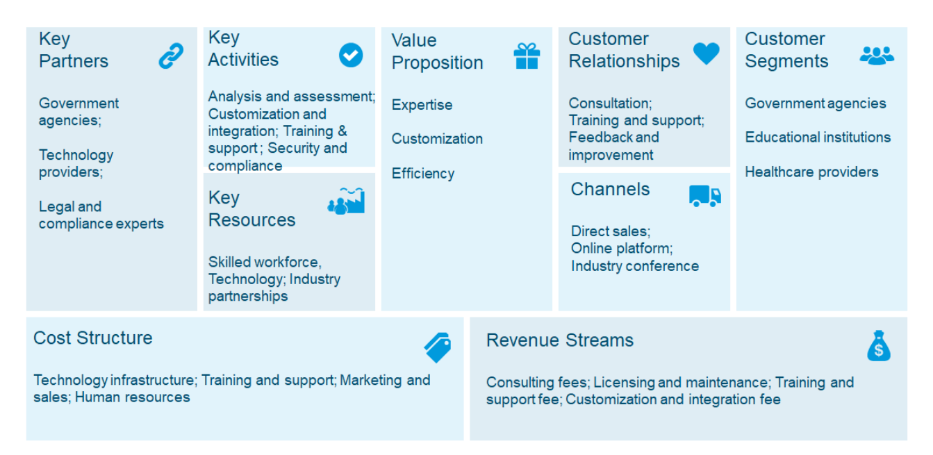
Figure 8 Model 2 (long run): Integration and Consulting Service business model

Model 2, Integration and Consulting Service business model , is the second business model advised for the public sector, as depicted in Figure 8. It is a long-term business model that is built around integration and consulting services. Given IMPULSE's potential to integrate microcredentials, Model 2 provides public sector entities with the expertise, support, and customization required to successfully implement and manage electronic identification and microcredentialing systems. This model offers a variety of services to ensure that IMPULSE aligns with the unique needs and requirements of the specific agency. At the same time, it can streamline the integration process to reduce disruptions and enhance efficiency. As opposed to the short-term model, this archetype is focused on the unique value proposition and close, collaborative customer relationship that allow IMPULSE to fully leverage its both its technical features and the strong expertise behind it.