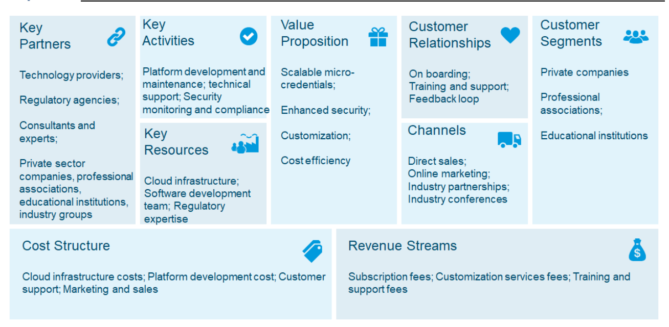
Figure 10 Model 4 (long-term): Subscription based Credential Management business model